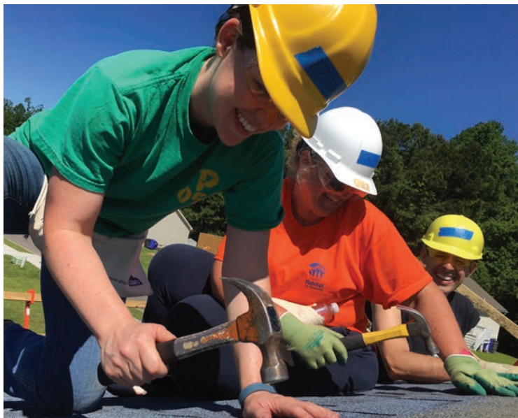
Ingevity and its employees are involved in the local chapters of such organizations as United Way, Habitat for Humanity and Meals on Wheels.